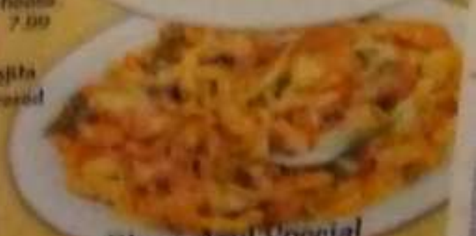
Playa Azul Special