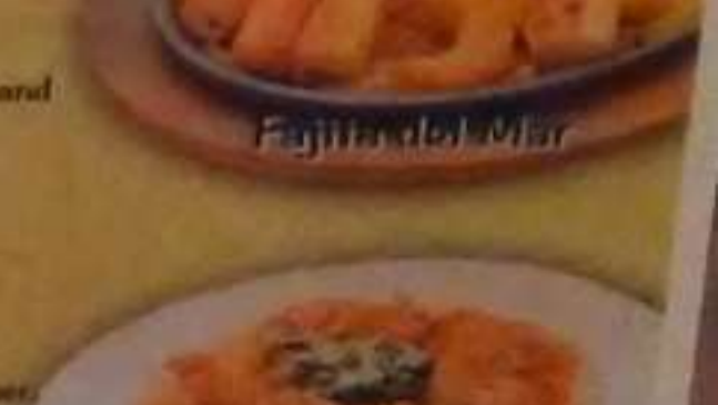
Fajita del Mar