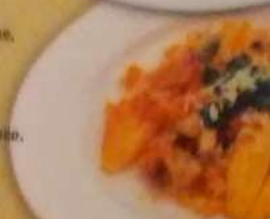
Pescado Playa Azul