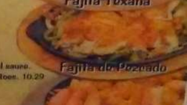
Fajita de Pezcedo