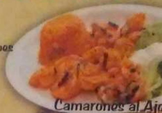
Camarones al Ajo

Stuffed flour tortilla with grilled shrimp, deep fried to a golden brown, topped with cheese sauce. Served with lettuce, sour cream, guacamole, pico, and two sides.