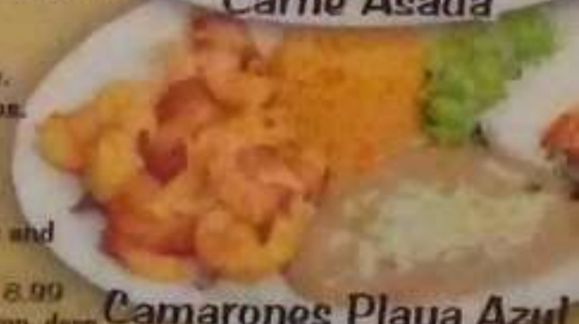
Camarones Playa Azul